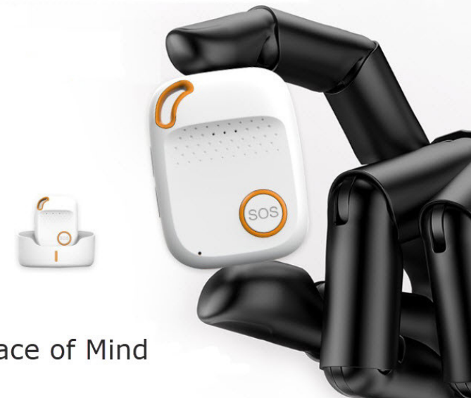
Peace of Mind