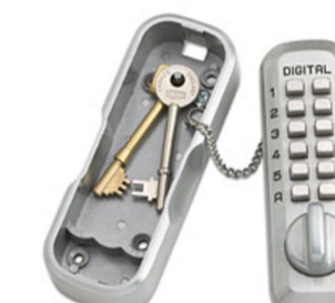
19. Key safe