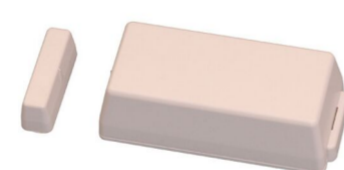
21. Door exit alarm