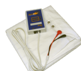
28. Epilepsy alarms