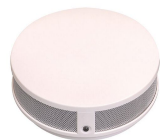
9. Smoke detector