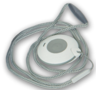
2. Pendant alarm button