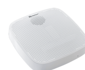
29. Two-way speech audio extender