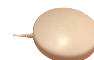
24. Under pillow vibration alert - sensory impairment solution