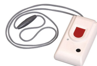
5. Automatic fall detector - triggers on tilt