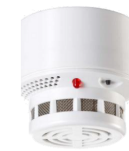
13. Low temperature hypothermia detector