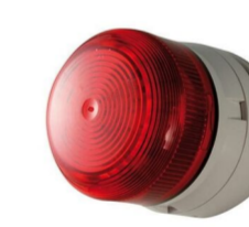
23. Sound and flashing beacon - sensory impairment solution