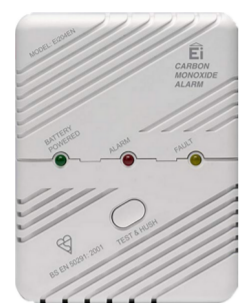
10. Carbon Monoxide (CO) detector