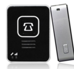
27. GPS location tracker 'Lola'