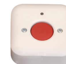
7. Fixed position panic button