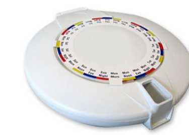
20. Pill dispenser/alarm