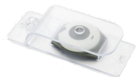
3. Easy Press Adapter (for use with 1 & 2)