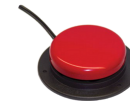
22. Jelly switch