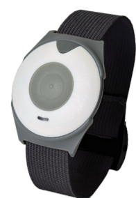
1. Pendant alarm wristband