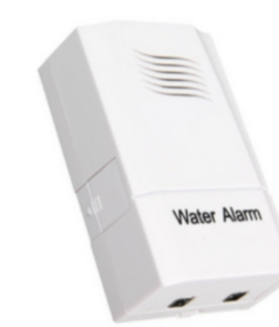
12. Flood prevention water alarm