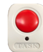
6. Bogus caller button