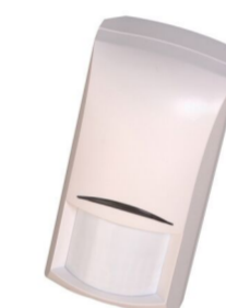
18. Bed exit sensor