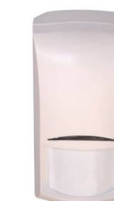
14. Inactivity sensor