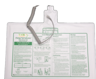
16. Chair exit alarm pad