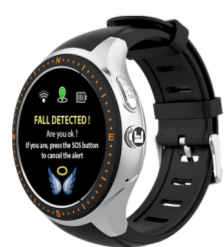
26. GPS location tracking 'LookWatch'