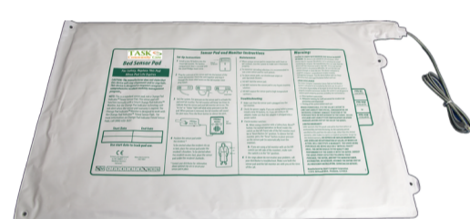
15. Bed exit alarm pad