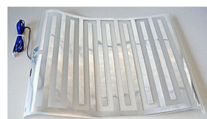
20. Enuresis sensor pad