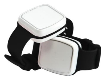
4. Automatic fall detector - triggers on impact