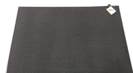
17. Floor sensor alert mat