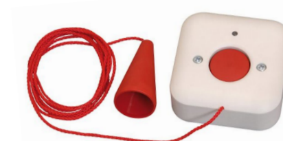
8. Emergency pull cord