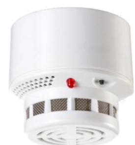
11. Natural gas detector